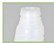
Snap On Neck