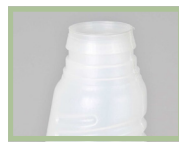
Snap On Neck